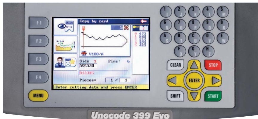
New user friendly key board

Code Maker cards downloading and transfer function; 1 USB port and 1 RS232 port connectivity; Automatic Calibration.