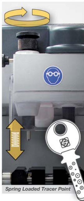
Spring Loaded Tracer Point

The spring loading of the tracer point, activated by rotating the locking nut, allows the tracer point to be properly located into the original key making easier the key cutting.