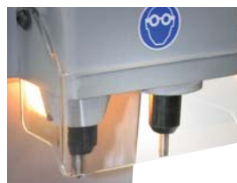
Illumination / Protective Shield

Safety Master Switch: the master switch turns the machine off automatically when power fails; when power returns the switch must be reset manually to provide the machine with voltage.